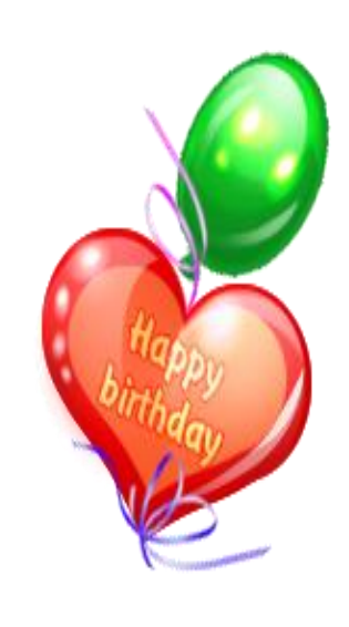
Age is a number to be celebrated!